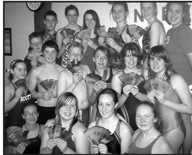
AQUA DUCKS WINNERS: 22 swimmers competed in a Scarborough swim meet in January, all of which placed in their events capturing 92 ribbons. 55 of them were 1st, 2nd, or 3rd place. The Ducks are getting ready for the next meet in Guelph University in February.

Plan to attend this charitable event that endeavours to engage local youth with law enforcement, in a positive way on Thursday, Feb. 19, 2pm, at the Acton Arena.