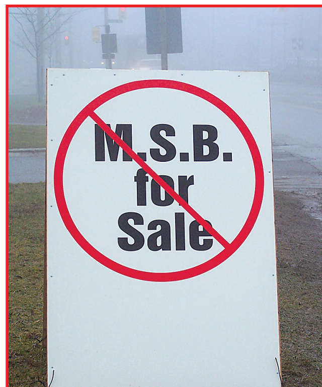
A SIGN OF THE TIMES: Signs such as this one out front of Home Hardware are showing up everywhere as the community continues to protest against the selling of MSB land.