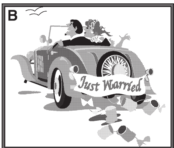
ANSWERS: 1. Birds in sky 2. Tire missing 3. Groom has eyebrow 4. Groom has goatee 5. Bride's veil is missing