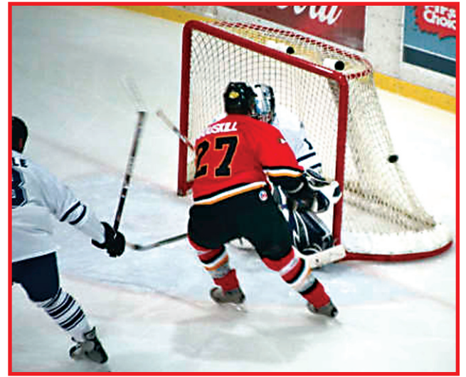
IN OR OUT: The camera doesn't lie but does the scoreboard? Halton Hills Firefighters scored where it matters in a game against Leaf Alumni. Funds raised went to Cancer Assistance Services.

This Friday Acton Optical faces off against X Marks the Fitness Spot at 10p.m. DNR Contracting visits Staying Alive Fitness at 11p.m. This will be the last game for the regular season; no games on Friday, Feb. 6. Playoffs begin Friday, Feb. 13.