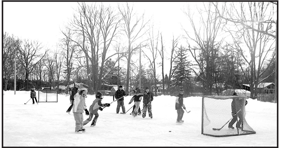
FREEZING FUN: This time of year, Canadians can't wait to lace up and hit the ice. The outdoor ice pad at Lloyd Dyer Park is in great shape thanks to the freezing cold weather and the volunteers who maintain it. Kids were out in droves this week, despite the cold, to skate and play hockey.