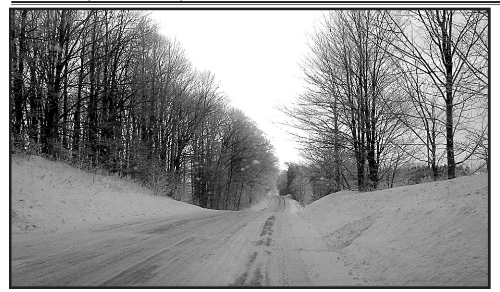
CRACKLING COLD: Temperatures dropped well below freezing this week and trees along the Dublin Line reflected the early morning light with frosty branches outlining the rural road.