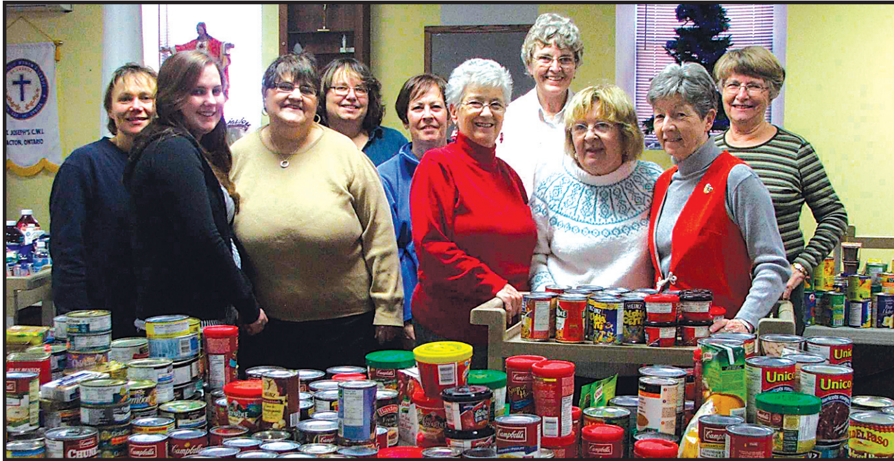
SORTERS AND PACKERS: Some of the volunteers who sorted food and packed 89 hampers for the Acton Christmas Hamper committees before Christmas. The volunteers worked on the Thursday and Friday prior to Christmas Day. The hampers were delivered on Saturday