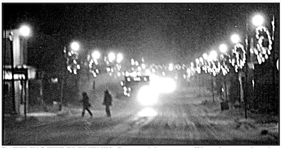
BATTLING THE ELEMENTS: Day or night town staff have been out keeping streets and sidewalks in Halton Hills clean. In this photo taken at the corner of Main and Wilbur Sts. on one unpleasant evening you can see the snow plough at work in a maze of Acton Christmas lights