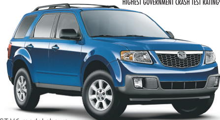
GT-V6 model shown

Additional HOLIDAY OFFERS UP TO $1,000 on selected models †††