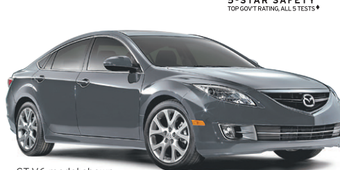
GT-V6 model shown

★★★★★ 5-STAR SAFETY TOP GOVT RATING, ALL 5 TESTS*