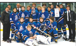
Acton hockey teams win tournaments in Fergus and Delhi. See pages 16 & 17.