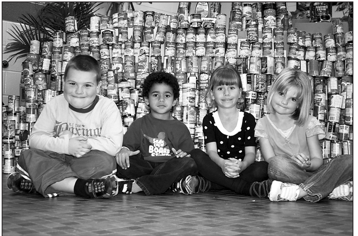
DRIVEN STUDENTS: Recently, students at St. Joseph School in Acton responded to the call from Acton Foodshare with a total collection of 2,613 pounds of food, filling the bare shelves in the foodshare location in time for Thanksgiving. Special thanks are extended to the educational assistants and everyone who participated or donated.

Bring your old cell phones, and ink cartridges. They will be collecting them at the Community Living North Halton table. A tree will be planted for every 20 items collected.