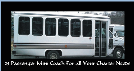
25 Passenger Mini Coach For all Your Charter Needs