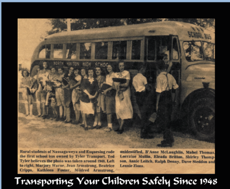
Transporting Your Children Safely Since 1948

The 24th of May Is Our 79th Anniversary Tyler Transport Ltd.