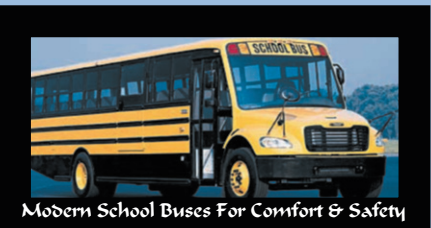
Modern School Buses For Comfort & Safety