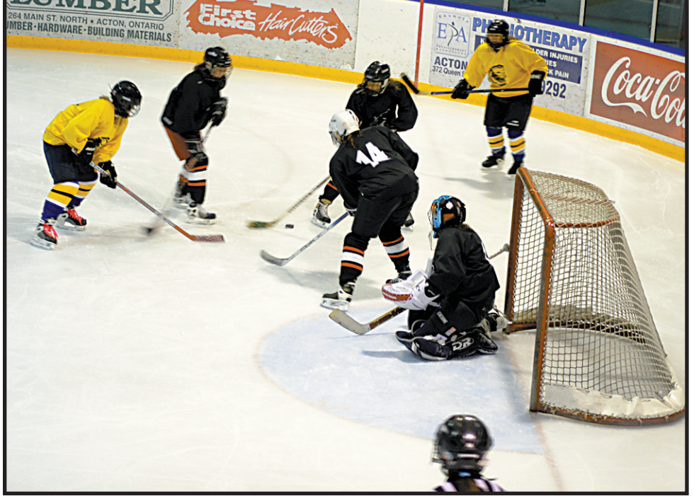
SWIMMING WITH SHARKS: Two Cougar players are out manned at the Sharks net last friday helping the Sharks hold off the Cougars charge in last Friday's championship game.