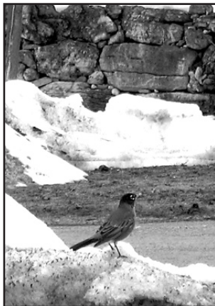
HERALDING SPRING: This little red-breasted robin is a welcome sight, as its arrival is a sure sign that spring is here. He still has a lot of snow to contend with however, as is shown by the dirty, winter weary pile on which he perches.

The investigation came to a head on June 2, when about 400 police officers arrested 17 men and youths. The 18th suspect was arrested two months later.