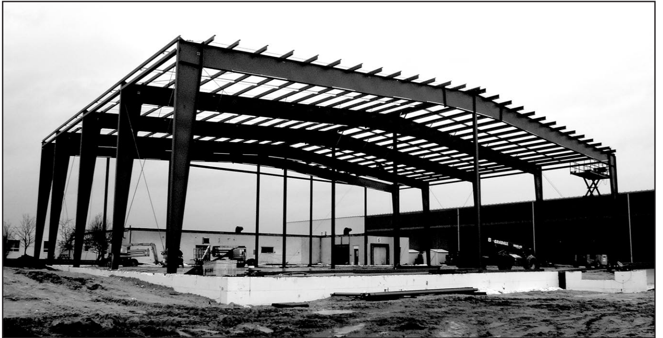
NEW BUILDING: Superior Glove begins the construction of its new building, an expansion that will not only increase business but also be power efficient. This skeleton is the first stage of the building, which can be seen from Hwy 25. Completion date is set for March 10.