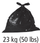
23 kg (50 lbs)

Containers and bags should weigh no more than 23 kg (50 lbs). Items that are too heavy will not be collected. Do not put material out in cardboard boxes.