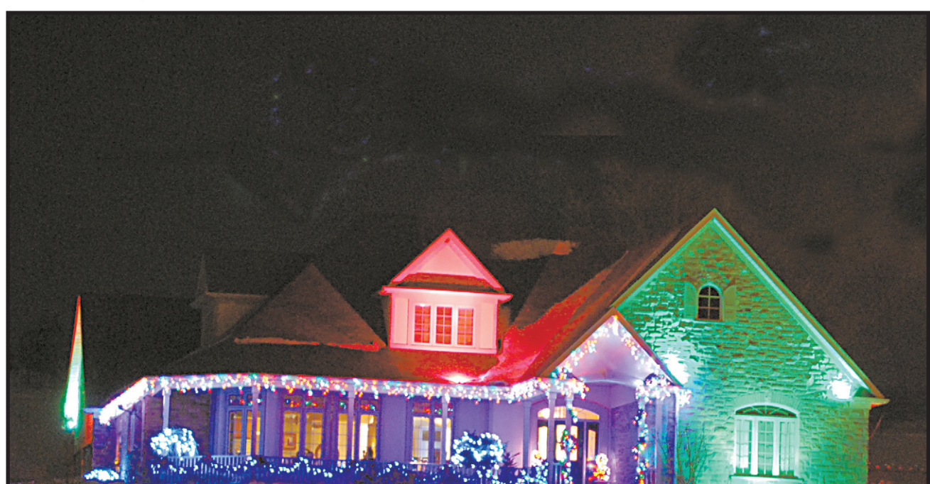
ALL LIT UP: Home aglow with lights in The New Tanner's circulation area such as this one on Turtle Lake Drive have been delighting the Christmas light tours. Most of them will till be burning over the New YEar so it's not too late for alight tour.