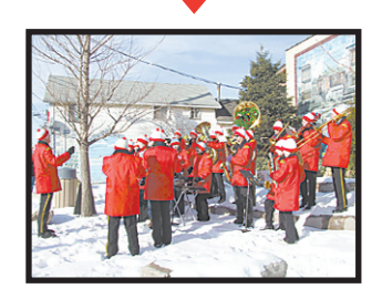
Acton Citizens' Band never gets enough recognition for its participation in events. See editorial Page 6