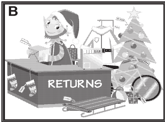
ANSWERS: 1. Sign says, "Returns." 2. Train missing 3. Two stockings hanging 4. Santa suit is white 5. Three $ on register instead of four