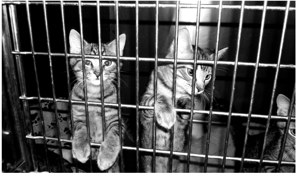
TAKE ME HOME: The Acton Veterinarian Clinic has these little cuties up for adoption to good homes. It's the time of year when litters showing up all over the place with no mothers, and some workers in Acton's industrial area brought these orphans in two weeks ago. There are four in this litter looking for a home and two younger kittens from another litter. Stop in and meet these rambunctious, friendly felines. You may find a new addition for your family.

Literacy North Halton is in need of tutors for its Read*Spell*Write Program based in Acton. No experience is necessary, all tutors trained. Registration goes from January 14 to February 22. Please call 905-873-2200 for sign-up.