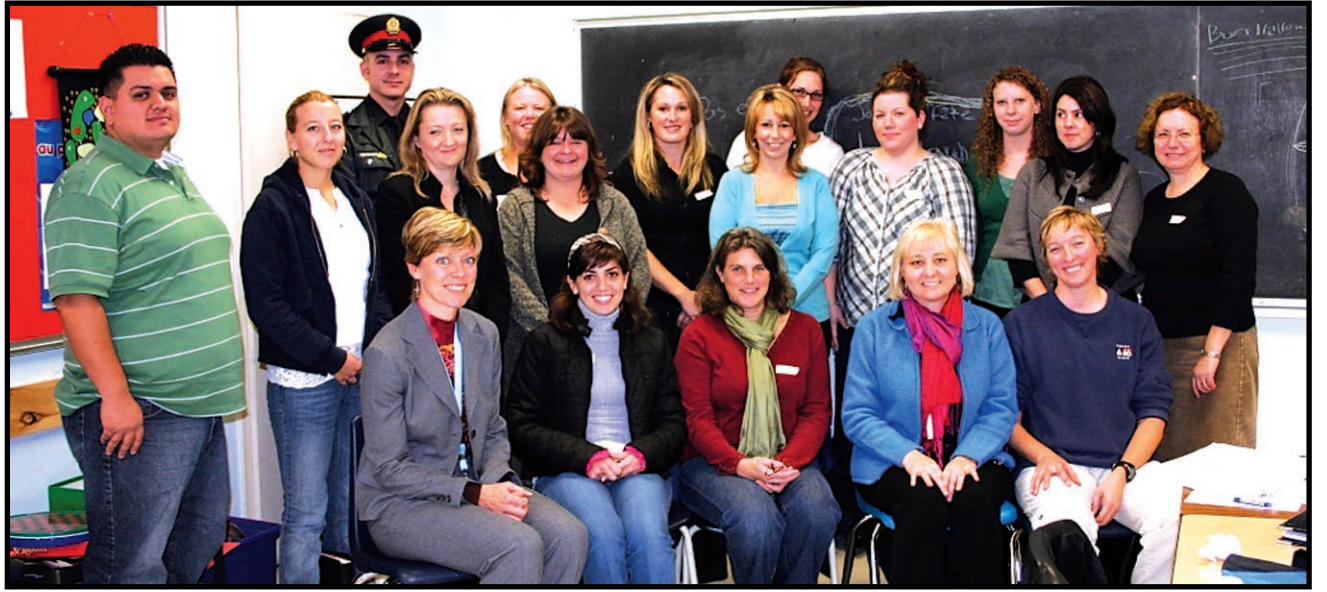
HUB TEAM: The Acton Hub team includes representatives from public and Catholic school boards, Halton Region, Children's Aid Society, Transitions for Youth, ROCK (Reach Out Centre for Kids), and Halton Regional Police.