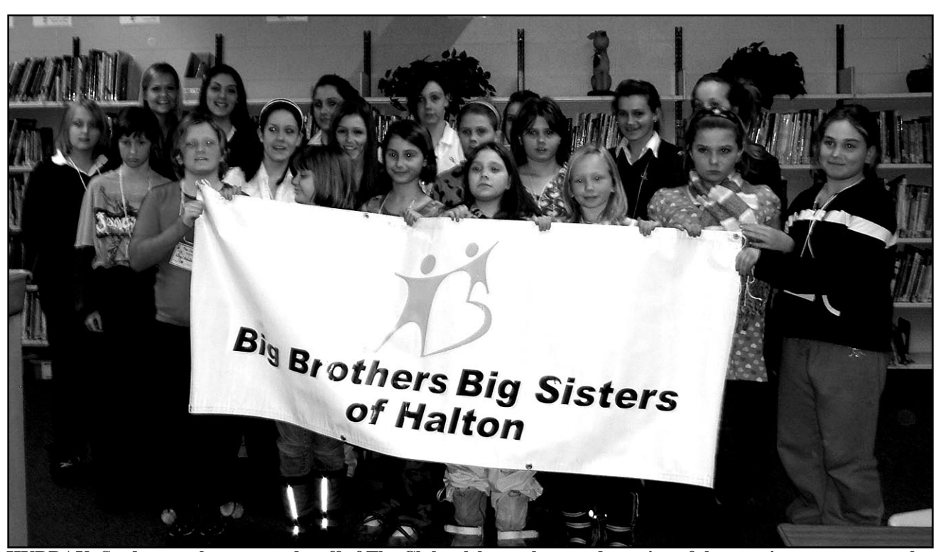
HURRAY: Students, volunteers and staff of The Club celebrate the grand opening of the tutoring program run by Big Brothers Big Sisters of Halton at St. Joseph Catholic School on Tuesday, Dec. 4.