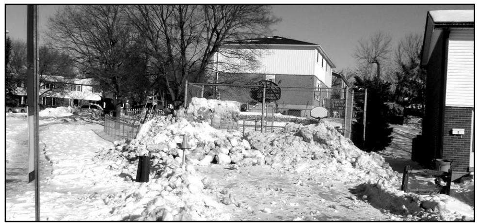
A SNOW PILE: Town workers spent days clearing snow around Acton after the storm that blew through last Saturday night. Piles, like this one on Kingham Road, could be found all around town.