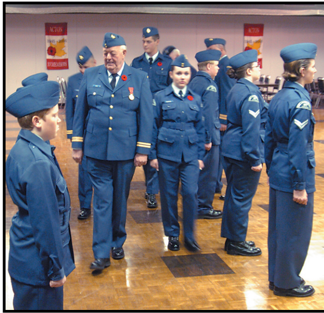
Inspection at the Change of Command