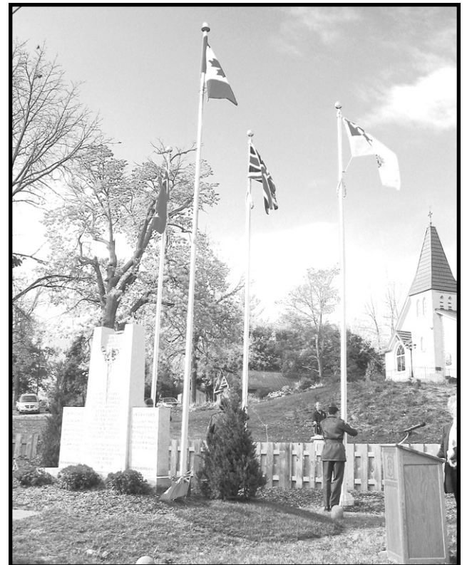
Former mayor says these flags do not follow protocol