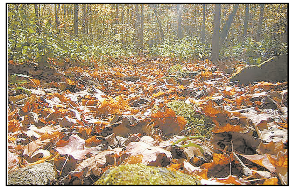
GOLDEN LEAVES: Fall leaves litter the ground like a natural carpet on the Bruce Trail, just south of 17 Side Road.