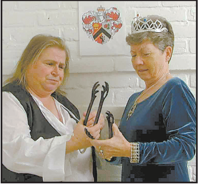
DINNER THEATRE: Chief wench, Nell, and lady Penelope, discuss the usefulness of these unusual objects as they prepare for the upcoming visit of the King and Queen of Actonia as the Acton Old Town Hall Dinner Theatre presents another evening of entertainment on Saturday, Nov. 3.