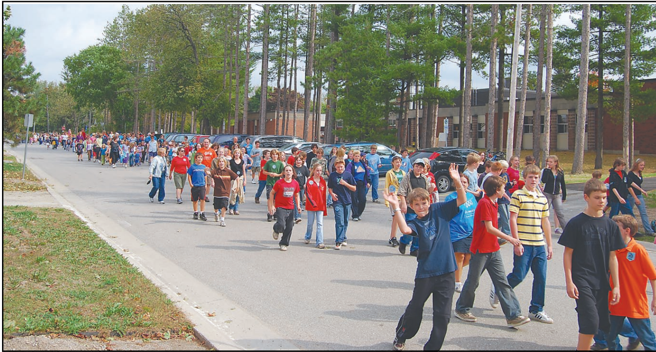
WORLD RECORD BREAKERS? Rockwood came out in droves to help Ontario break the Guinness World Record for the greatest number of people walking one kilometre simultaneously, currently held by Western Australia (100,915). In Wellington County, 24,551 people walked with 656 of those in Rockwood. We'll find out if it beat the record after October 12.