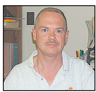
Acton soldier returns home from six month tour of duty in Afghanistan. - Page 15