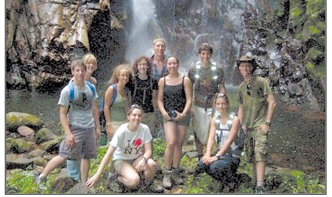
VISIT HONDURAS: Acton High students enjoy a biology trip to Honduras, espacially the rain forest.