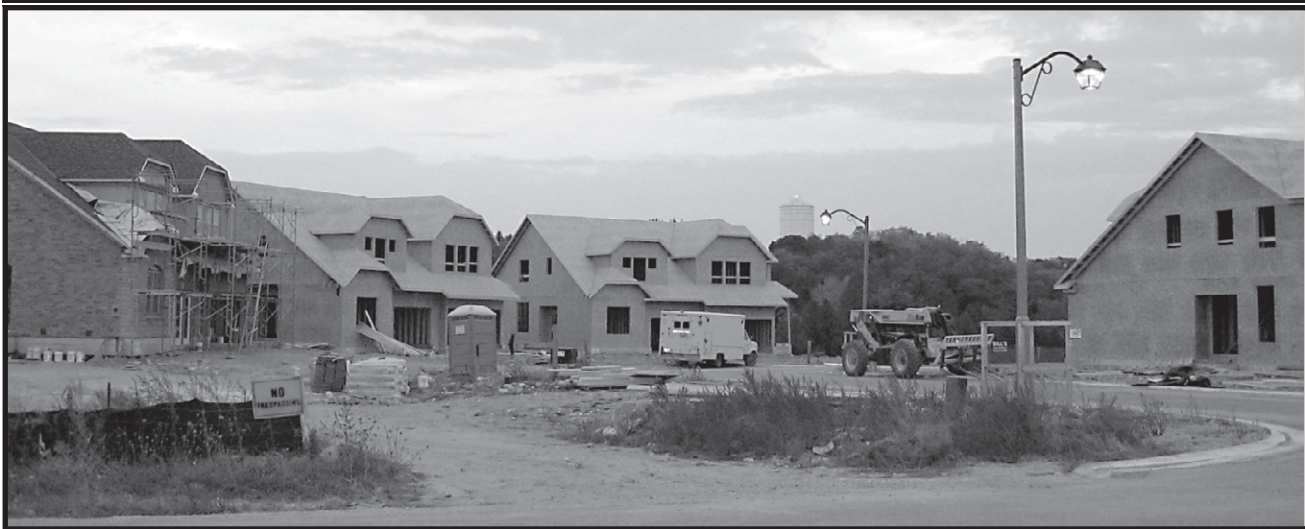
THE CHANGING FACE OF ROCKWOOD: What was once a view of tall Pines near Cobblestone Place is now a view of a new development in Rockwood, with about 40 homes being built here. The township is currently discussing increased sewage capacity with the City of Guelph, which would allow the expected increase of 5000 new residents in Rockwood in the next five years.