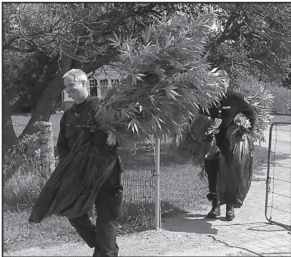
TIPPED OFF: Police seized about 5,400 marijuana plants in a joint force operation in a field on the Fourth Line, just east of Acton, on Monday morning. It's estimated the street value of the plants would be $2 million.

“Halton voters should consider some key questions as the October 10th election approaches,” continued Carr. “What will each candidate do to ensure that municipal infrastructure funding programs are targeted at the infrastructure required to accommodate growth? What will they do to ensure the objectives of the Fairness for Halton campaign are met? Are they willing to vote against their party if it means a better future for Halton?”