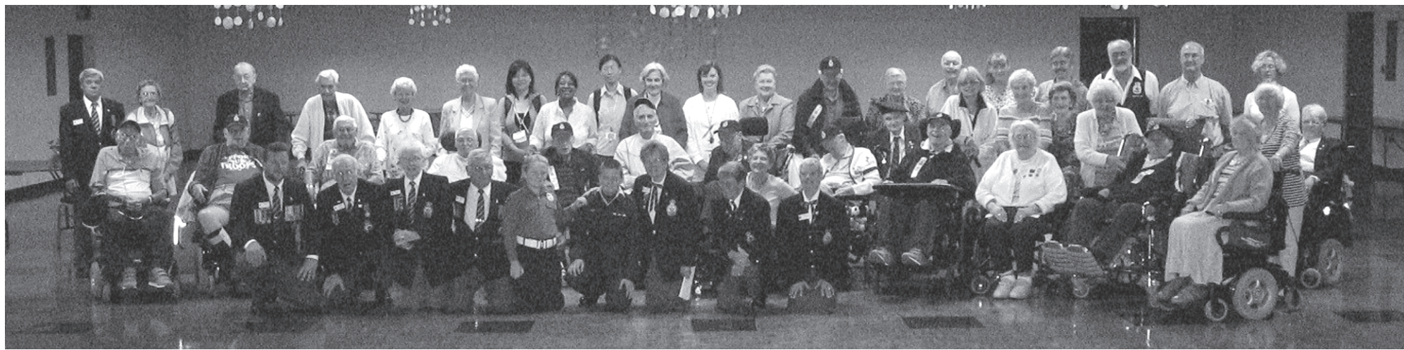
WELCOME VETS: Branch 197 of the Royal Canadian Legion welcomed 16 veterans from Sunnybrook Hospital at the branch on Sunday where they were feted by legion members and assembled for a group photo before they left.