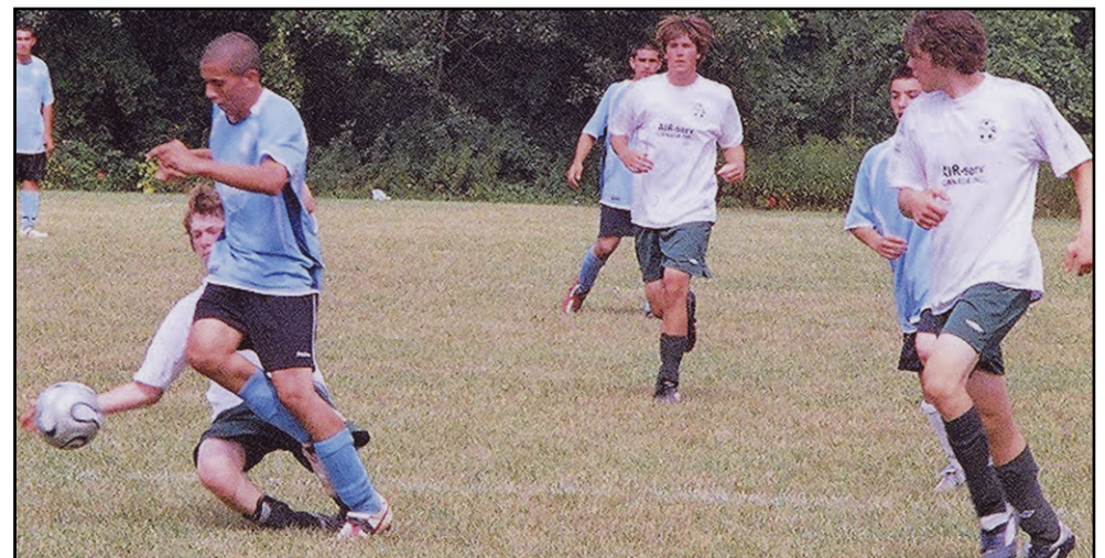
TOO FAST AND FURIOUS: Flying tackle by a Caledon Defender shows the intensity of Sunday's Peel Halton boys Under 16 soccer final. Game ended early at 2-2 due to spectator interference. Bolton forfeited the match.

Sunday at Acton High School the teams met again; Caledon earning the championship under very different circumstances. Last year a fatigued Bolton side and was unable to cope with the hardworking Caledon team. This time they authored their own misfortune, giving up a 2-0 lead and the game abandoned by the referee with the score 2-2, only minutes from