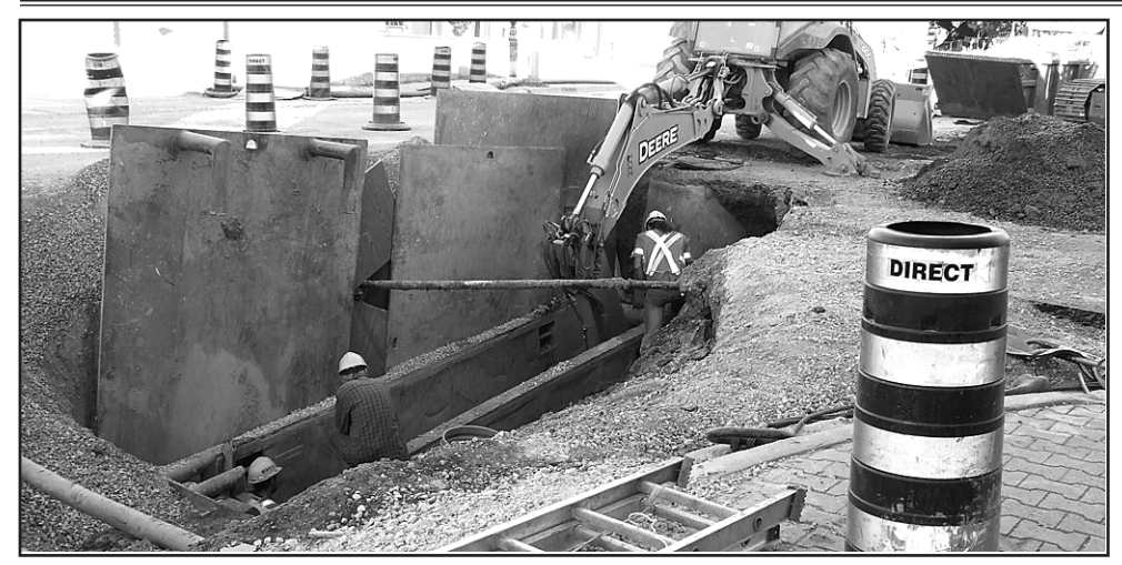
Workers dig deep under Main St. to install sewers, watermains.