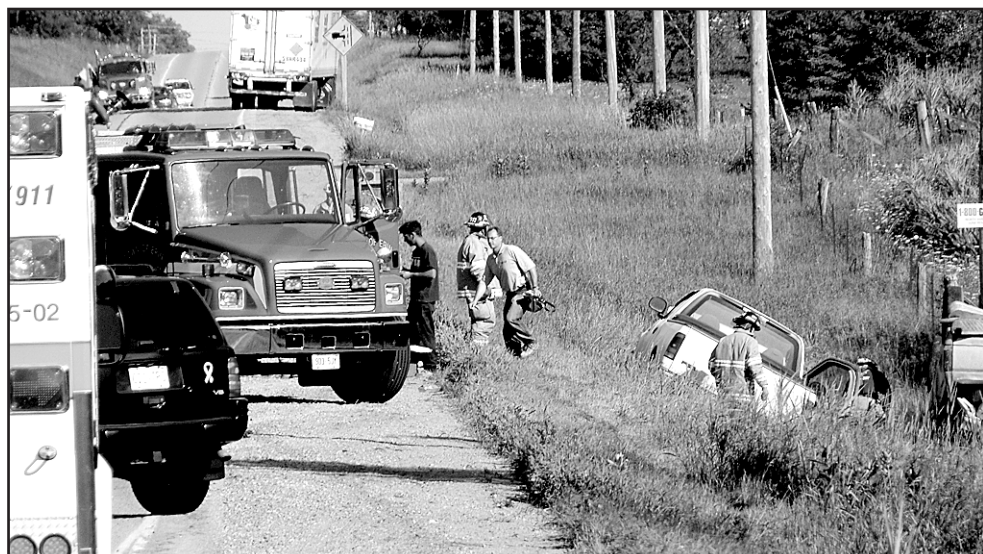
DOUBLE WHAMMY: Monday morning, Regional Rd 25 (formerly Hwy 25) was closed just south of Wellington Rd. 24 (formerly Hwy 24) with a four vehicle collision. A Chevy Suburban hauling a trailer crossed the centre line clipping a tractor-trailer and then ended up in the brush. Two other vehicles, trying to avoid the collision also ended up in the ditch. All injured were treated and released from hospital.

A survey also found that the number of water samples taken by homeowners in Halton decreased from 7,000 samples in 2004 to 4,000 in 2006 and 37 per cent of the wells tested had bacteria contamination.