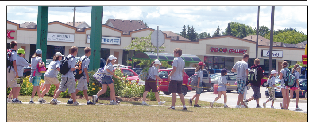
FOLLOW THE LEADER: Camp Weseska summer camp is in full swing. On Friday, 75 children each held a gigantic yellow rope and walked from the camps at the 4th Line to Prospect Park for one of the many outings they get to experience this summer.