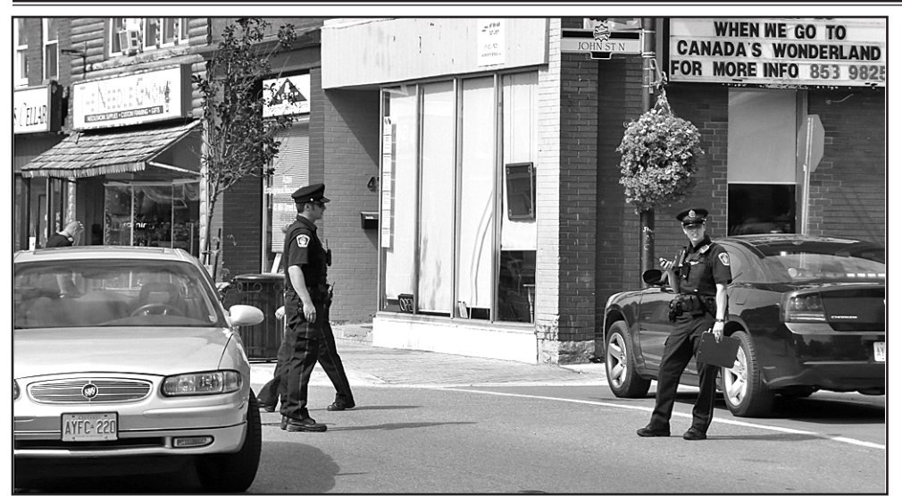
DRIVER CHARGED: The driver of a car that struck a pedestrian crossing Mill Street at John Street after 9:30 on Tuesday morning was charged with making an unsafe turn. Police did not identify the injured pedestrian, a 73-year-old Acton woman, but said her head injuries were not a serious as first thought.