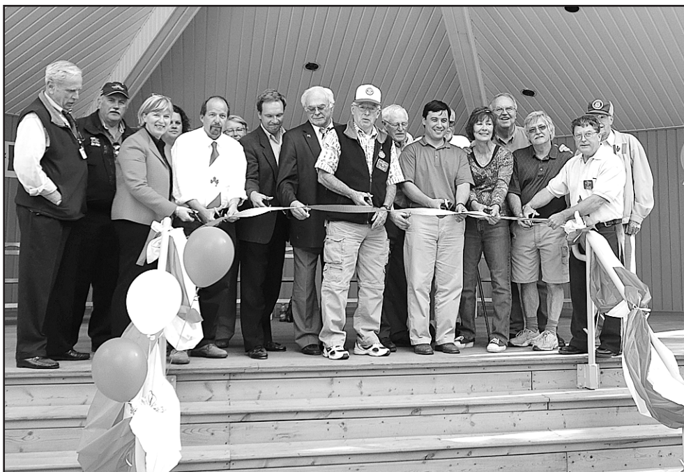
OFFICIAL SNIP: Members of the Rotary Club of Acton each grabbed a pair of scissors to help cut the ribbon to officially open the Rotary bandshell in Prospect Park at a Canada Day ceremony.