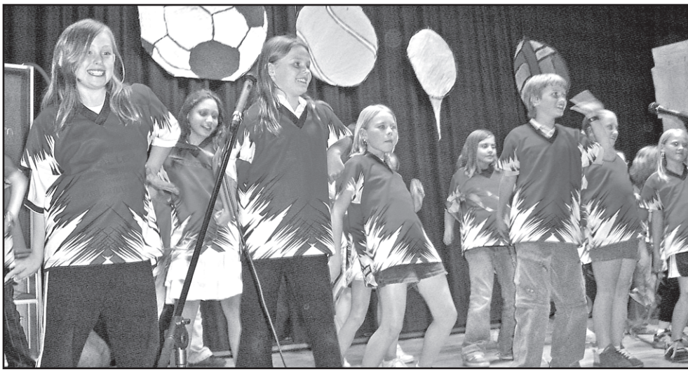
SPRING FEVER: Members of the Junior Everybody Dance Club at Robert Little School strutted their stuff and entertained a standing-room only crowd of proud parents and teachers during the school's annual spring concert last Thursday.