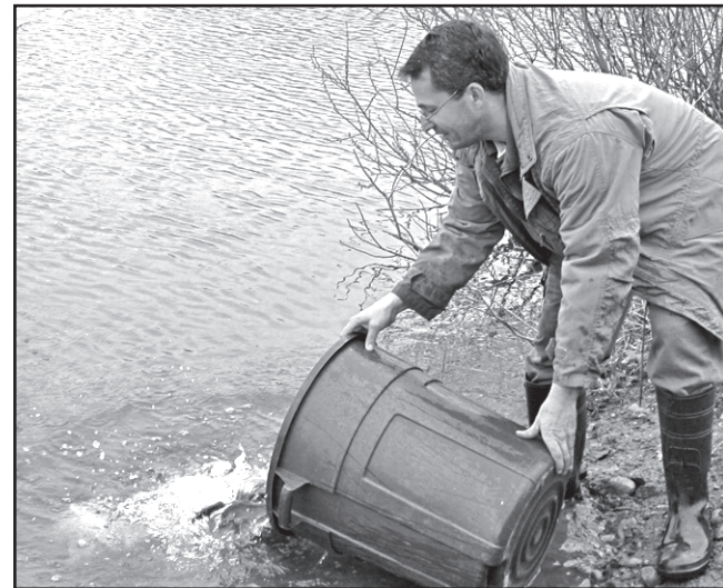
STOCKING TROUT: The MNR is stocking several waterways in the area with delicious brown trout to promote outdoor activities and appreciation of nature. Fishing season opens this coming Saturday, April 28.

The trout were raised in a fish culture station (hatchery) and are now about ten inches long. Locally, the MNR is stocking 500 fish in Marden