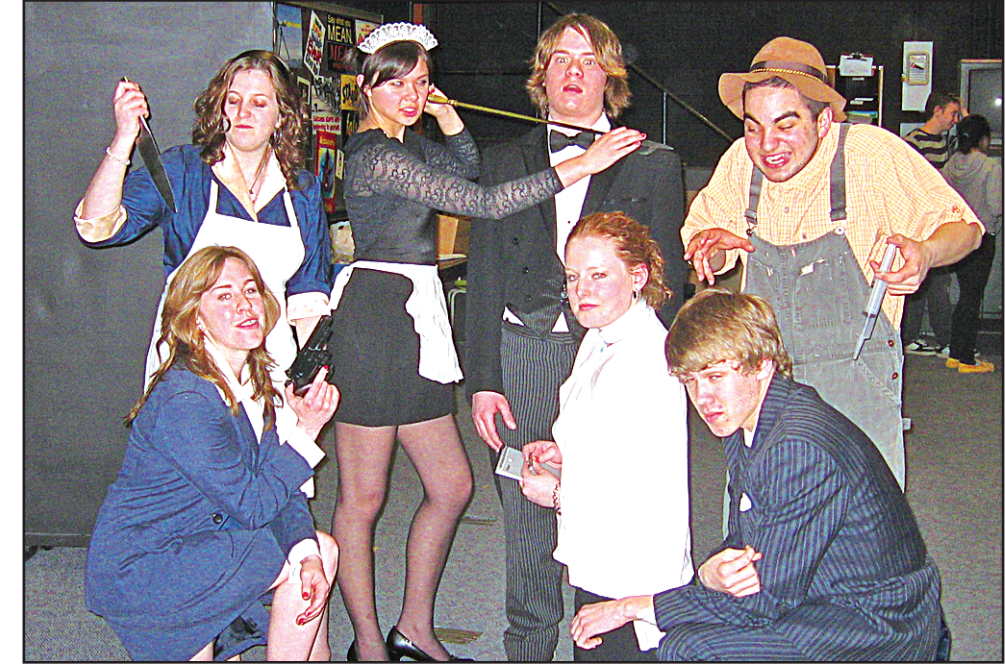
'KILLER' CAST: The audience will decide at intermission who they want the killer to be in the Acton High School production of Murder's in the Heir which opens tonight (Thursday) at the school. Tickets are available for 7:30 p.m. shows on Friday and Saturday.

Keeping it real! I can be reached by telephone at 905-873-2601, ext. 2342, or by e-mail at mayor@haltonhills.ca.