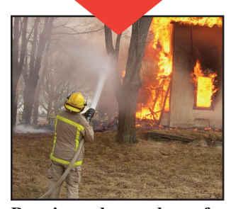
Burning a house down for exercise. It happened last Saturday on the Sixth Line. Page 11.