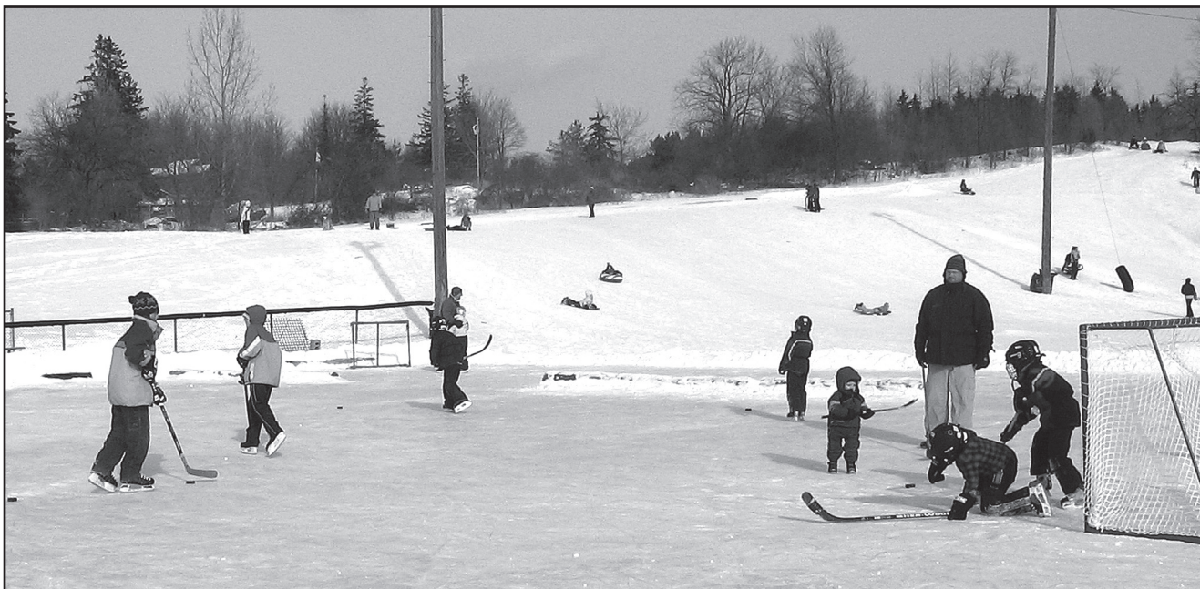
RINK RESPONSIBILITY: Eden Mills outdoor ice rink at Memorial Park is enjoyed by the surrounding community. Like the other five rinks in Guelph/Eramosa, it is built and maintained by volunteers. The Eden Mills group is disputing a volunteer policy proposed by the township.