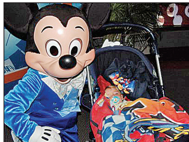
Mickey says hello!

tificate on Wednesday, February 7 and my passport on the 9th just in time to leave on Feb. 10th.