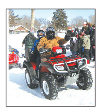
The weather was bone chilling cold but Winterfest at Acton Legion attracted the hardy. See Page 4.