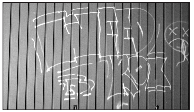
VANDALS HIT PARK: Halton police are investigating several incidents of Christmas vandalism after two downtown businesses and numerous locations in Prospect Park, including the Rotary bandshell, Agricultural Society construction site and the Boathouse, were defaced with spray painted graffiti.