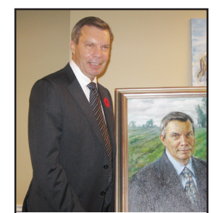
An Eramosa farmer is inducted into the Agricultural Hall of Fame. See Page 13.