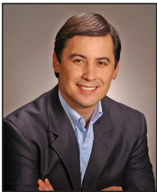
MP Michael Chong