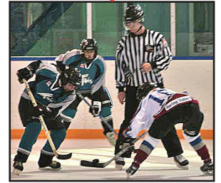
Twisters win five titles at girls' hockey championships. Page 17.