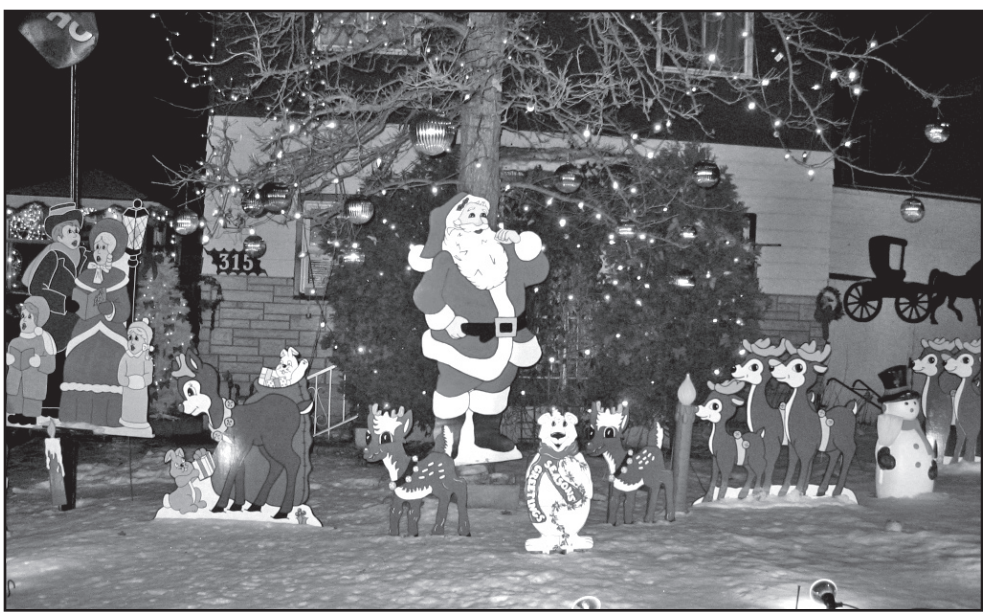
A LITTLE NORTH POLE: This Rockwood house is all decked out for the holidays. It was bound to get noticed as it is on the Farmer's Parade of Lights route. Rebecca Ring