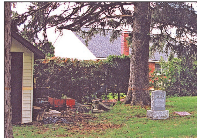
SAD STATE: The volunteer Rockwood Cemetery Committee asked council to address their complaints regarding the management and grounds keeping under Woodlawn Memorial Parks. This photo was taken at the back of the cemetery, where debris was piled beside a shed, near some gravesites.