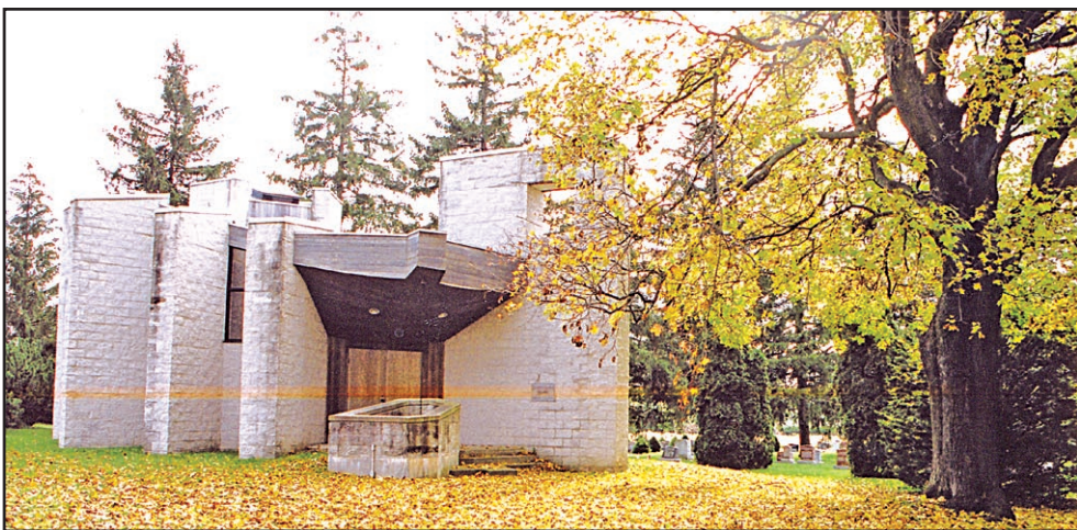
CEMETERY COMPLAINTS: The volunteer Rockwood Cemetery Committee is unhappy with Woodlawn Memorial Parks, which manages the grounds and chapel. A new roof was put on the chapel, but still leaks.