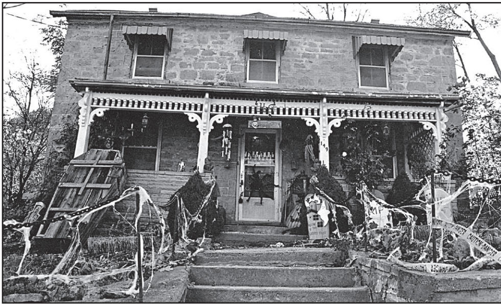
VERRY SCARRRY: This house on Main St. South in Rockwood is sure to creep out even the bravest trick-or-treaters on Tuesday night.