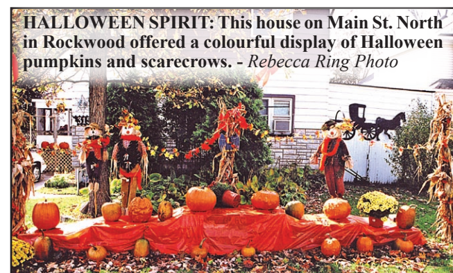
HALLOWEEN SPIRIT: This house on Main St. North in Rockwood offered a colourful display of Halloween pumpkins and scarecrows.