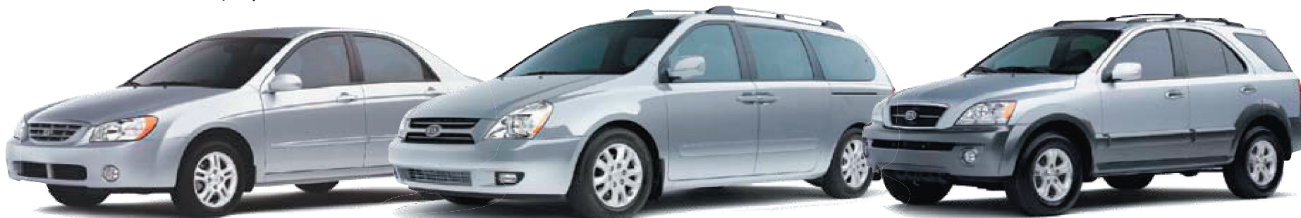
2006 Sorento MSRP $27,895*