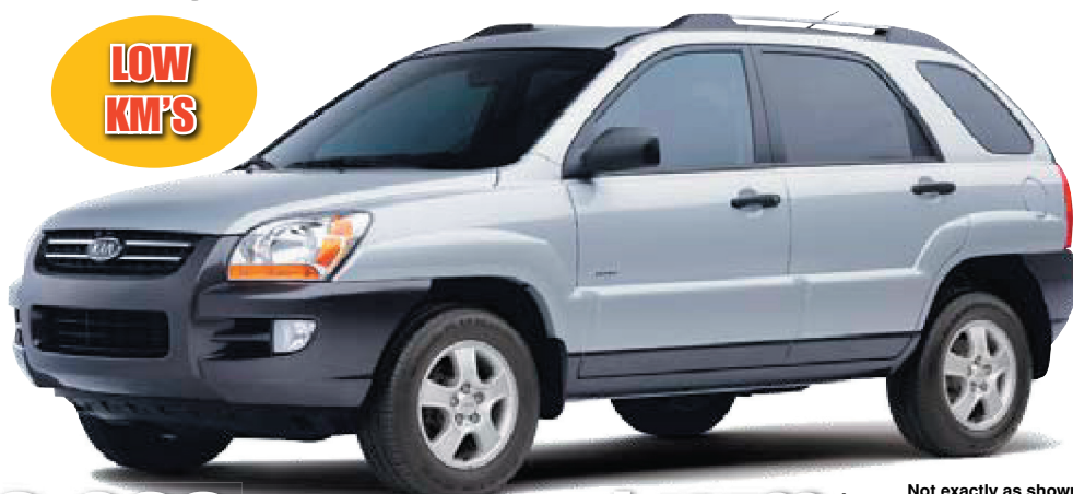
Not exactly as shown

Only $22,988 or $0 DOWN $167 88 † /Bi-Weekly